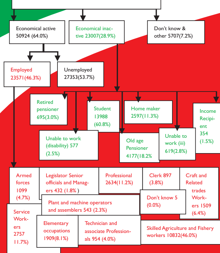
Economically Activity status of population aged 15years old and above in Kavango East, 2011 Census (79638)